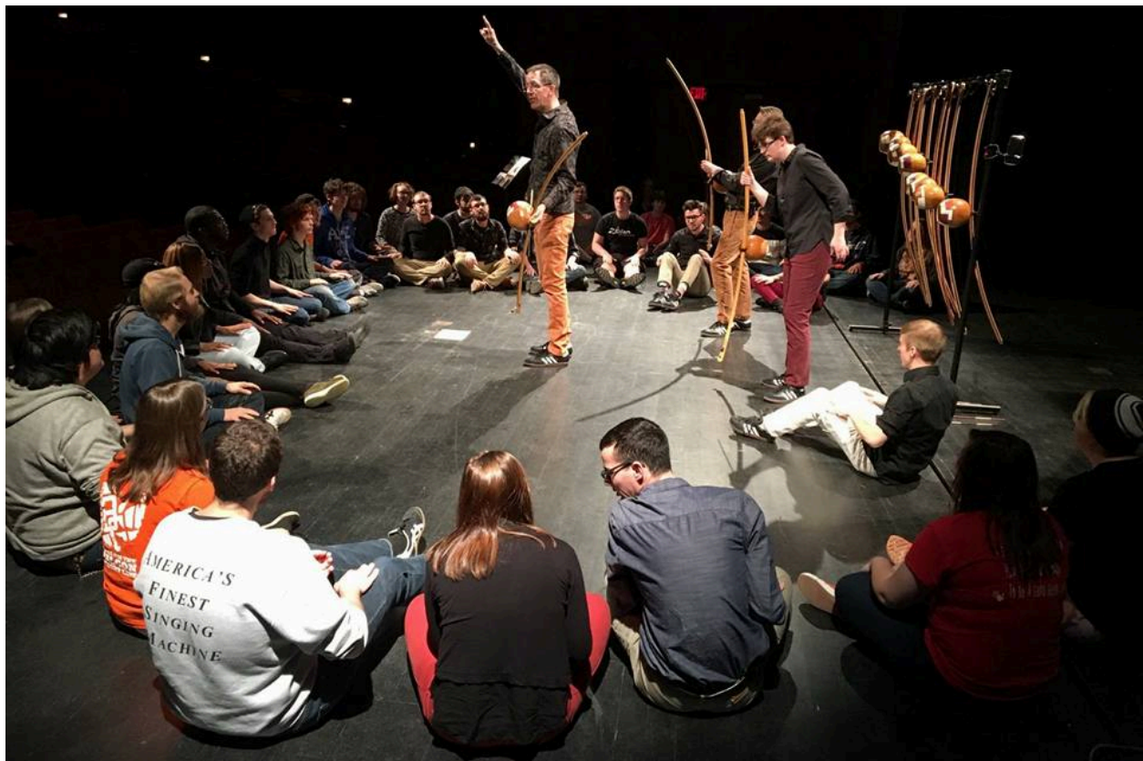
Projeto Arcomusical @ Bowling Green State University, March 2017.